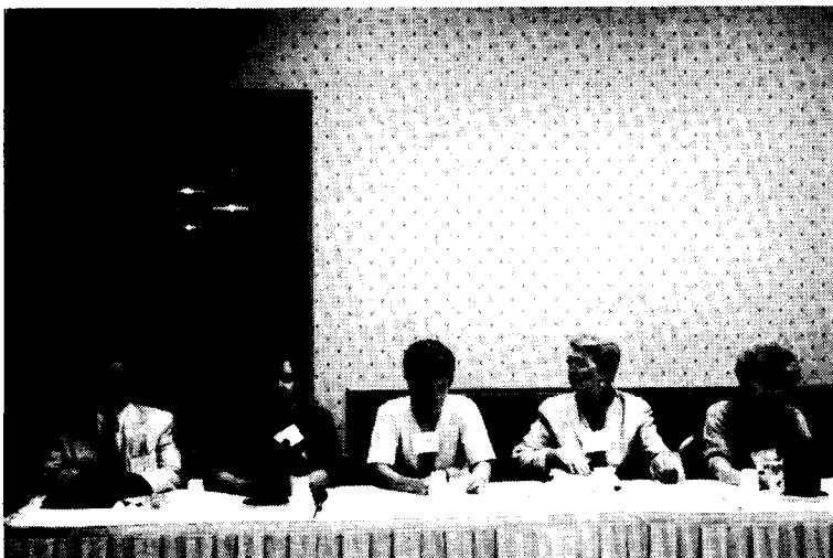
Community resources panel addresses the impact of violence on children and families